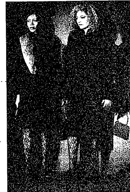
Trend alert: Lace hosiery and faux fur trim turn these outfits into something extraordinary.