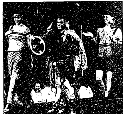
Drive my car: Fashion layering becomes fun and funky when patterns, length and colors are mixed.

SEW-WHAT NORTH AND CENTER • SOUTHFIELD 41110 E. 14th St. • 1/2 mile S. of Center Rd. (248) 423-3069 STORE HOURS: Daily 10-6 • Sun 12-4