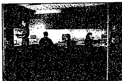
Security system: Pictured above (top) are the areas that can be covered with a modern security system. The bottom photo shows a team monitoring the system.

monitors are manned around the clock every day of the year. A monitor there even keeps track of weather systems.