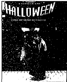
Ghoulish get-ups: At Fairlane, Halloween Headquarters (a division of Spencer's Gifts) awaits with all you need for spooky celebrations.