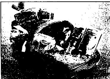
Something new: (Above) Frank's 5 Seasons stores will offer assorted gourmet food products, sold separately or in customized gift baskets, $1.30-$2.92.

"Our focus groups have told us what we do well and what we need to do better," she said. "And we're listening."