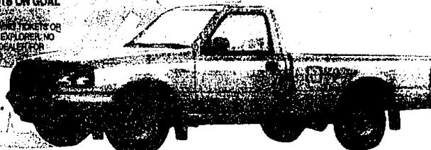
97 FORD RANGER