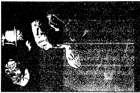
Jaycee jitters: Farmington Area Jaycees Haunted House on Orchard Lake, south of 14 Mile in the Knart parking lot, is in full swing this week. It's open nightly through Halloween. Call 477-5227 for information.