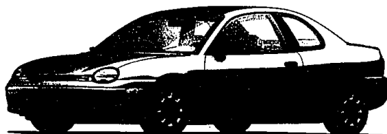
1998 Plymouth Neon

for up to 60 mos. ‡ with up to $2,700 in finance savings