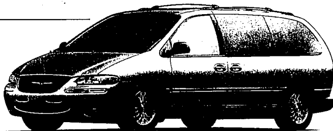
1998 Chrysler Town & Country LXi