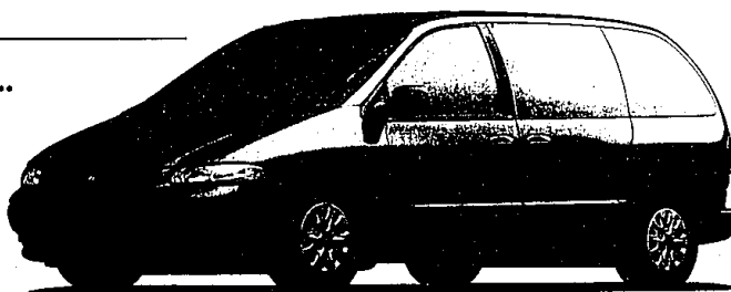
1998 Plymouth Voyager