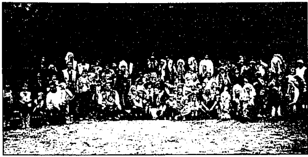
Brave new world: Shown are approximately 95 parents and children of the Farmington YMCA Guides and Braves Program, who recently attended their first weekend campout of the season at the YMCA Camp Manitoulin, located in the Grand Rapids area. Also at the camp was a nature speaker who brought numerous snakes, turtles and frogs for kids to learn about.