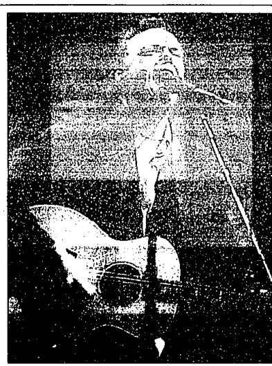
Live caffeine: Songwriter John Hiatt performs at Borders Cafe, 1 p.m. Friday Nov. 14. 34300 Woodward, Birmingham; (248) 203-0005.