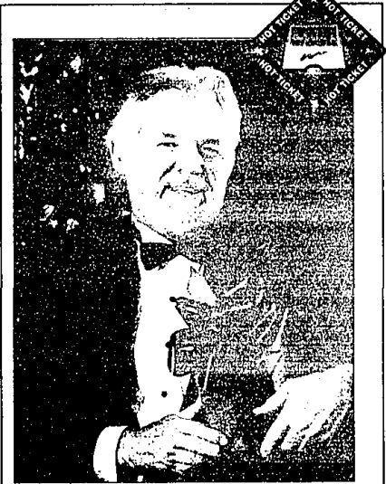
Holiday show: Kenny Rogers tells the magical tale of "The Toy Shoppe," and sings hits from "The Gift" and popular Christmas carols 8 p.m. Friday, Dec. 5, 2 p.m. and 8 p.m. Saturday, Dec. 6 and 3 p.m. and 7 p.m. Sunday, Dec. 7, at Masonic Temple Theatre. Tickets $35, $30 and $25, call (248) 645-6666.

drawn wagon rides, 6-10 p.m. Friday, Dec. 5, Saturday, Dec. 7, Friday, Dec. 12, Sunday, Dec. 14, Friday, Dec. 19, Saturday, Dec. 21, Wednesday, Dec. 24, Thursday, Dec. 25, 6 p.m.-midnight Wednesday, Dec. 31, Riverside Park along the Huron River, Ypsilanti's Historic Depot Town. Donations accepted. (313) 483-4444 or http://www.ypsi.org