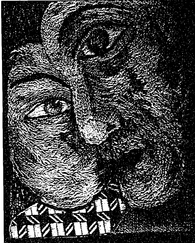
An eye-ful: "Image and Object," an exhibit of 14 diverse artists, opens 5 p.m. Saturday, Jan. 17 at the Sybaris Gallery, 202 E. Third Street, Royal Oak; (248) 544-3388.