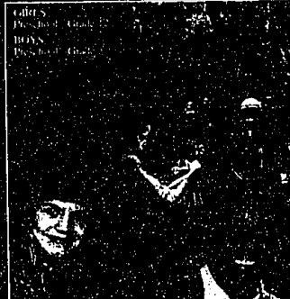
Academy of the Sacred Heart Bloomfield Hills • 248-646-8900