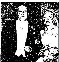
Country Club of Detroit. The newlyweds honeymooned in Florence, Italy, and they are making their home in Birmingham.