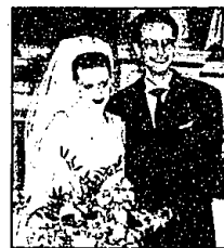
weds honeymooned in Puerto Vallarta, and they are making their home in Boston.

A reception was held at the Bay Tower in Boston. The newly-