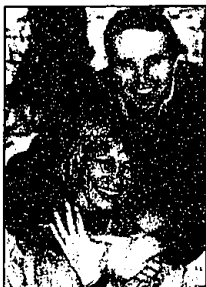
the Shrine Chapel of Our Lady of Orchard Lake.