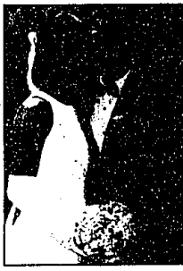
Rica, and they are making their home in Boston.

A reception was held at Forest Lake Country Club. The newlyweds honeymooned in Costa