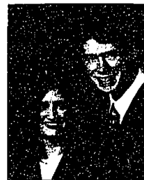
An April wedding is planned at First United Methodist.

Her fiancé is a graduate of Napoleon High School and Spring Arbor College. He is a substitute teacher in Birmingham and a youth ministry assistant at First United Methodist Church in Birmingham.