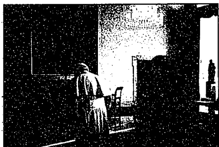
Leading prayer: His Holiness John Paul II second leads a prayer at the Vatican.