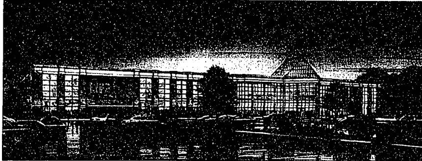
The new Life Time Fitness of Troy (above) features 90,000 square feet of facilities including an indoor swimming pool complex with two-story waterslide (below right), indoor climbing walls (below center), basketball, volleyball, racquetball, squash and free child care.

Perhaps most interesting is the company's trademarked Multivision Frequent-Sees entertainment system; an invention that allows members to workout while watching any of twenty 60-inch television screens and listening to the audio portion on the FM band