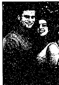
A May wedding is planned at St. Regis Church.

Her fiancé is a graduate of Brother Rice High School, the University of Notre Dame and the University of Michigan. He is a chief orthopedic surgery resident at the University of Michigan Health System.