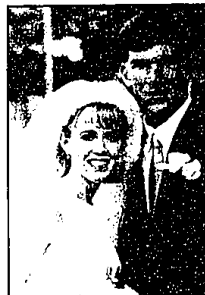
Switzerland and Austria, and they are making their home in Birmingham.

A reception was held at Detroit Golf Club. The newlyweds honeymooned in Italy,