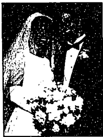
and they are making their home in Atlanta.

A reception was held at Ozaukee Country Club in Mequon, Wis. The newlyweds honeymooned on Santa Lucia Island,