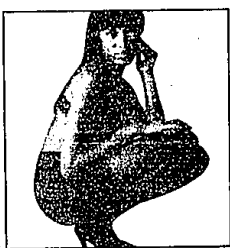
Sensual shapers: Victoria's Secret has a line of pantyhose that "sculpt the body from waist to toe," with four styles of contouring control panels.