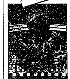
Hot Tix: Return to Rydell High School for a class reunion with the cast of "Grease!" through Sunday, May 31, at the Fox Theatre, 2211 Woodward Ave., Detroit. Tickets $42.50 to $11.25, call (248) 433-1615.