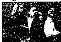
Mosaic Youth Theatre of Detroit presents the world premier of "hearBEAT" a new musical play about love, hate and rhythm, featuring some of the Motor City's most talented teens, 2 p.m. at the Music Hall Center, 350 Madison, Detroit. Tickets $15 adult, $7 students/seniors, call (248) 645-6666 or (313) 963-2366.