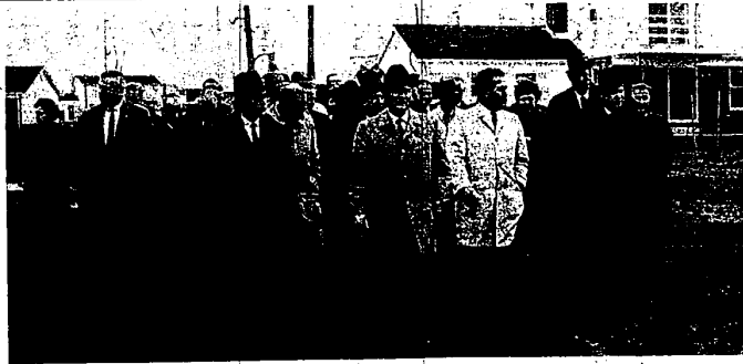
FIELD TRIP — More than 60 members of the Michigan Chapter of the National Institute of Farm and Land Brokers of the National Association of Real Estate Boards visited Farmington last week to see how things are done. The group