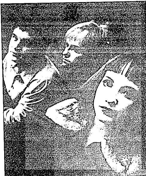
Playing Planetfest: Sixpence None the Richer performs songs off its self-titled album Sunday during Planetfest at Pine Knob.