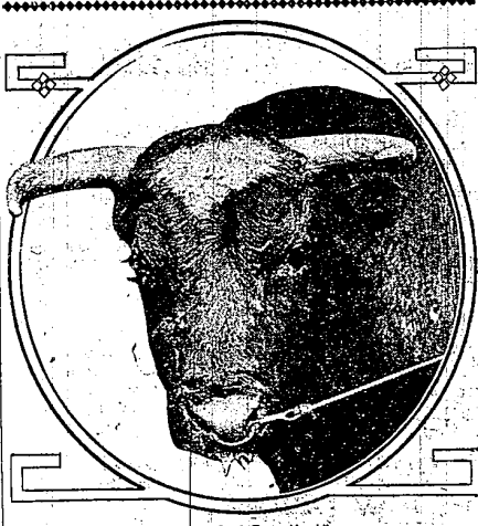
"Good Beef Type Head."