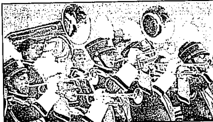
Perform: The Harrison High School marching band performed at the annual multicultural and multiracial rally Tuesday night.