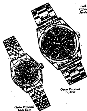
Look for our Official Rolex Jeweler Sign.