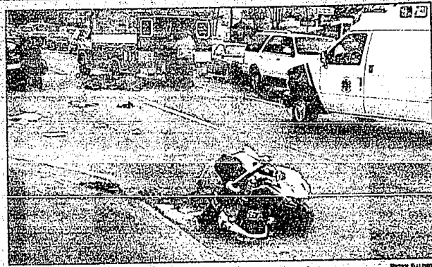
Aftermath: Farmington Hills fire and police officials stay on the scene following the death of a young motorcyclist killed after he broadsided a van Thursday night.

Compuware had 1998 calendar revenues of $1.5 billion. Compuware can be found on the World Wide Web at www.compuware.com .