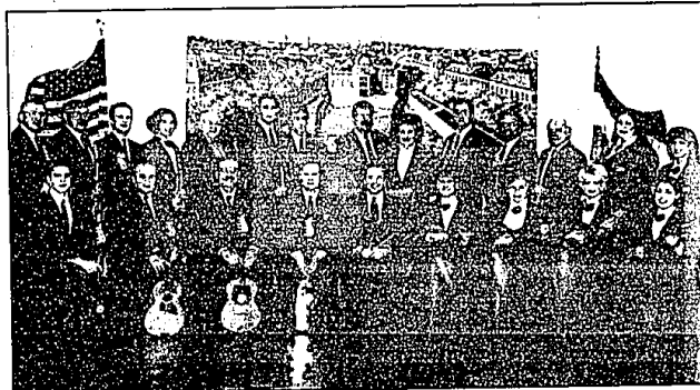
Folk group: The Detroit Tamuritz Orchestra has been performing for 41 years, perpetuating the musical heritage of Croatia.