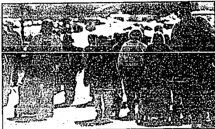
On their way: Walkers, including adults and kids, make their way on the eight-mile trek during WalkAmerica.

Get ready: Walkers get ready to go at Sunday's WalkAmerica for March of Dimes at Oakland Community College, Orchard Ridge campus. About 500 turned out for the annual event that raises money for the March of Dimes.