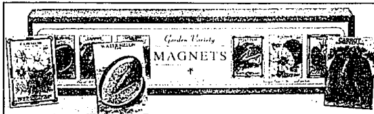
Garden plenty: Images from 1920s gardener's seed packets inspire Cavallini and Company's decorative magnets. Use them to post photos and children's art work, or give them to your favorite gardener, $25.50, Union General Store and Sweetshop Cafe, Clarkston.