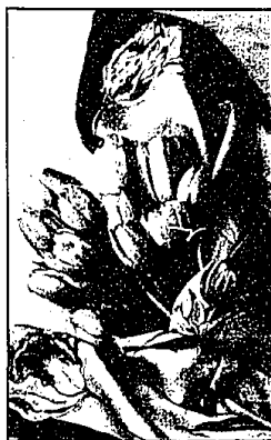
Commune with nature: Come a little closer to nature this season with Tiffany & Company's colorful Tulips scarf. Part of the Tiffany Nature collection, the 36-inch, silk square scarf, retails for $185, Tiffany & Co., The Somerset Collection in Troy.