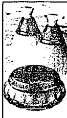
Body royal: Royal Doulton, maker of fine china and crystal, has launched a line of bath and body products. Presented in distinctive glass bottles with antique silver crowns, the collection runs $39 to $75, Jacobson's stores.