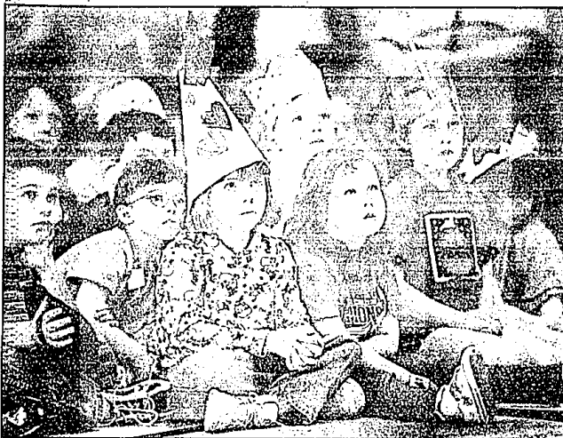
Enthralled: Students at Wooddale and Hillside elementaries recently enjoyed an innovative fine arts assembly by Tales and Scales. The school PTAs funded the performances.

The students of Wooddale and Hillside elementary schools were treated to an innovative fine arts assembly on Friday, April 30.