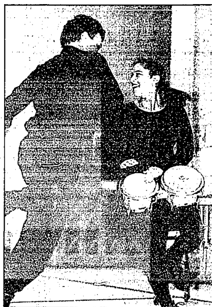
Fine fun: Cast members of Tales and Scales perform.

In addition to schools, the troupe performs in art centers, with symphony orchestras, and in schools.