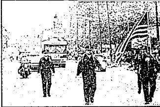
On the go: The Farmington Hills Police Department marches in the morning parade.