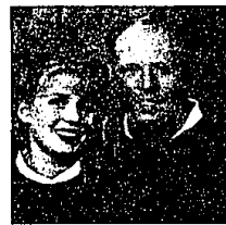
at North Congregational Church in Farmington Hills.