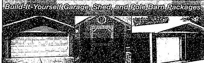
Build-It-Yourself Garage, Shed, and Pole Barn Packages