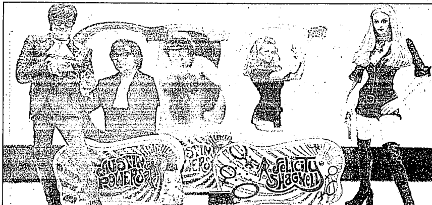
Look Alikes: Mike Myers was "instantly smitten" with Austin Powers dolls McFarlane Toys created. It took four tries to create a doll that met with actress Heather Graham's approval.