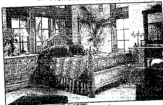
santiago bedroom, poster bed $1695, chest $1095

$2500 - $5000, you'll receive $100 back $5001 - $7500, you'll receive $150 back $7501 - $9000, you'll receive $225 back $9001 - $11,500, you'll receive $300 back $11,501 - $14,000, you'll receive $400 back $14,001 or more, you'll receive $500 back