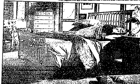
encounter bedroom, slat bed $799, night stand $375, chest $975

*With deposit and app. credit. Balance due 9 months after merchandise has been delivered.