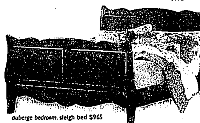
ouberge bedroom, sleigh bed $965

Thomasville has a vast selection of bed styles with many bedroom collections featuring twenty or more pieces including several bed designs! From sleigh styles to canopies, posters and more! And now during our Summer Sale, you can have the beauty and craftsmanship of Thomasville at exceptional savings and incredible finance terms.