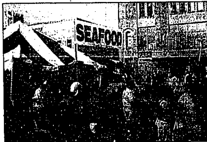
Eats: Whether it's seafood or ribs you crave, you're sure to find something good to eat at the second annual Arts, Beats & Eats, Labor Day weekend in downtown Pontiac.

Excellibur: Sinatra Ribs and Potatoes Rockefeller. Le Metro Bistro: Fruit