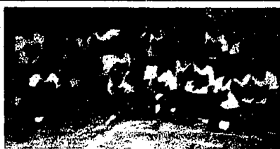
The Hammerheads hail the new millennium and remember March 16, 1999.