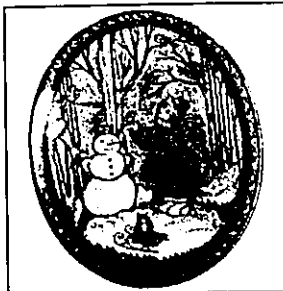
Somewhere in Time: Russian lacquer jewelry box, $149, Charlotte's in Rochester.