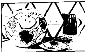
Pretty as a pitcher: Large ginger jar, $489.95, red pitcher, $84.95 and dish, $44.95 from Bellissima, Rochester.