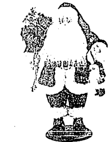
Collectible Santas, $35 or 3 for $90.