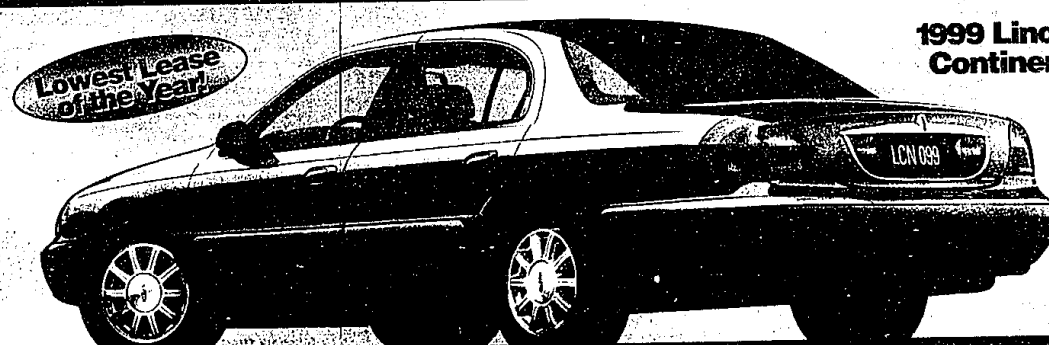
1999 Lincoln Continental

30-Month/30,000-Mile Red Carpet Lease Capitalized Cost ..... $32,216 Down Payment ..... $2,610 Refundable Security Deposit ..... $450 First Month's Payment ..... $429 Cash Due At Signing (Net of Incentives) ..... $3,489 $0.15/mile over 30,000 miles