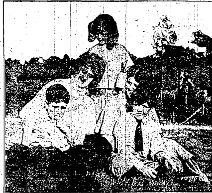
One of the families the American people are talking about and seeking information of, is the family of Senator Robert M. La Follette, candidate for the Republican presidential nomination. This paper presents herewith a snapshot of the senator's family, taken at home while La Follette was in Washington, attending a session of congress.