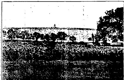
When Senator Robert M. La Follette, now in the public eye, was in the midst of his job of cleaning up Wisconsin, freeing it from the clutches of politicians and corporations and restoring, by legislation, its government to the people, he moved from the city of Madison to a farm. His new home was on the shore of Lake Mendota across from the city. Here he found quiet after each day of hard labor. Here, also, he took up farming where he had left it off as a young man on his father's farm, and found in its problems, relief for his overworked mind.

In laying out the property, he cleared timber from a space between the front of the house and the lake in the direction of the central portion of Madison and the purpose of this was seen when through this clearing, loomed up the dome of the state capitol across the lake.