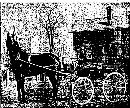
What boy does not grin with delight when called upon to drive to the railway station and bring father home to the bosom of his family? Such a grin adorns the features of Robert M. La Follette, Jr., in this picture. He has harnessed the roadster to the trap and is about to meet the senator from Wisconsin, now a presidential possibility, at the train as the latter comes from the nation's capital. Bob La Follette, Jr., is a husky, robust boy brimming over with spirits and enthusiasm.