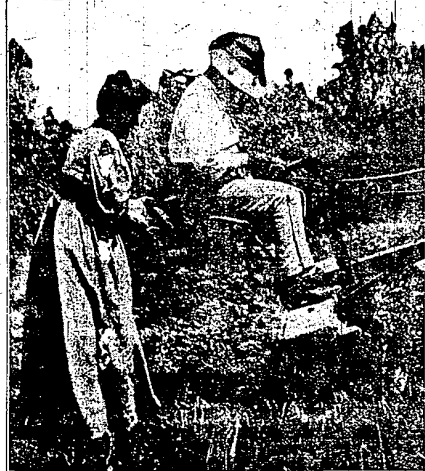
Whereas many public men take their physical exercise at one or more of the recognized athletic pastimes, Senator Robert M. La Follette, Progressive Republican candidate for president, when relaxed from his mental labor, enjoys an old pair of Mexican trousers and a big straw hat and plunges into farm work at his home near Madison, Wis.