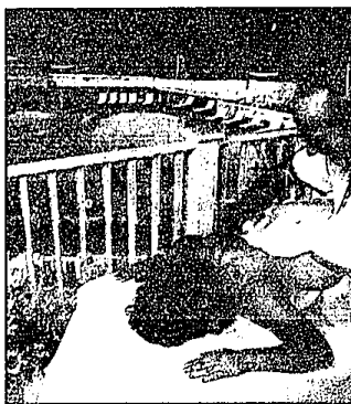
THE INN AT BAY HARBOR

Relax it's winter, but you can dream of the view of the bay at The Inn at Bay Harbor, which recently opened a European-style spa. Relax and feel the tension drain away as you enjoy a soothing massage.