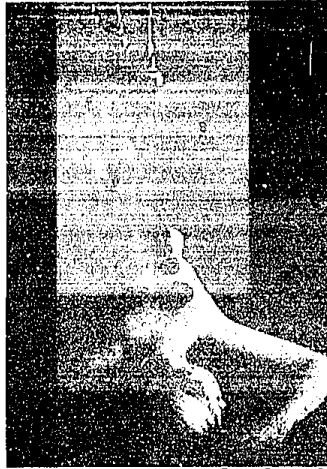
GRAND TRVERSE RESORT AND SPA

Stress relief: After a Sacred Stone massage, guests are treated to a therapeutic shower at the Grand Traverse Resort and Spa.