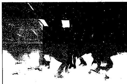
Spectacular finish: The Miami University Collegiate Team wraps up its recent performance in the 2000 Chevrolet United States Synchronized Team Skating Championships at Compuware Arena in Plymouth Township.