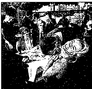
Now showing: An opening reception for "Theater Without a Plot: Runway," is on Saturday, April 29, at Revolution gallery at 23257 Woodward in Ferndale. Call (248) 541-3444. The exhibit is scheduled through May 27. Hours are 11 a.m. to 6 p.m. Tuesday through Saturday.

24-28 from 9 a.m. to 3 p.m. for 1st to 8th grade students. Weeklong camp costs $170 for BBAC members and $180 for non-members. 1516 S. Cranbrook, Birmingham. (248) 644-0866.