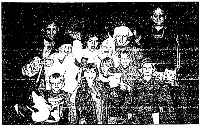
Ready for the stage: The cast of "The Reluctant Dragon," from September Productions, helped celebrate Month of the Young Child with a recent performance at Farmington High School, for families of Farmington Community School.