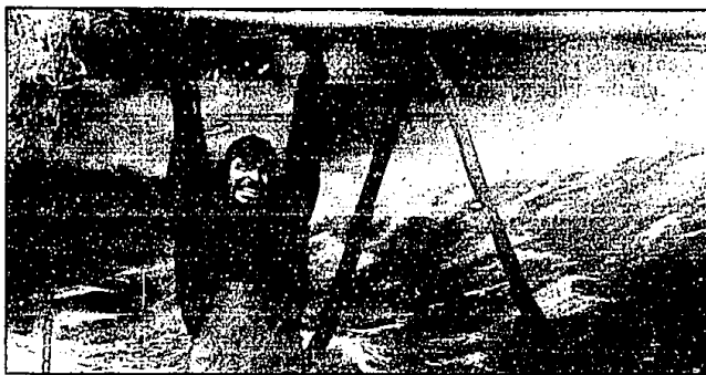
Drama: George Clooney hangs on in "The Perfect Storm."