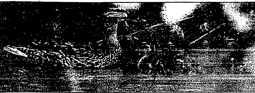
Her own lagoon: A mother duck had to herd her ducklings into the safety of a "lagoon" by the river banks because of the high speed of the river flow. At upper right, the Rouge flowed heavily, bringing debris.