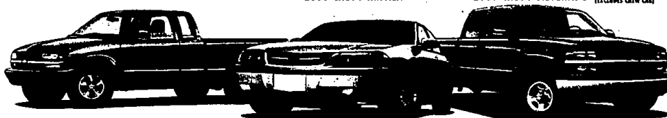
2001 CHEVY SILVERADO™ 1/2-TON EXT. CAB (EQUIPPED WITH C&D)

GM Employees and Eligible Family Members Only.