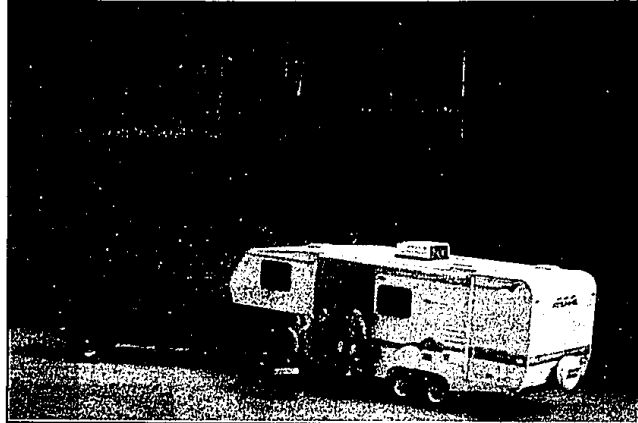
Get away: You can enjoy all the comforts of home and still get away from it all. At the Pontiac Silverdome Camper, Travel & RV Show patrons will learn how to turn vacation fantasies into reality.