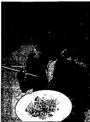
Far east food: Stephanie Huang is adept at handling a plate of rice and chopsticks.