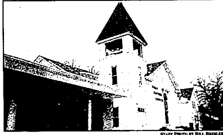
Historic church: First Baptist Church of Farmington is celebrating its 175th anniversary next month. The congregation was established in 1826.

For more information on First Baptist Church, call 474-0350.