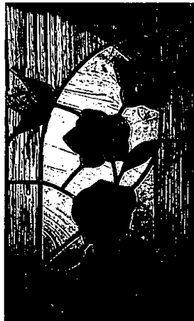
Great panes: Windows in garage doors can have a variety of looks, including stained glass (left) and leaded glass (below).