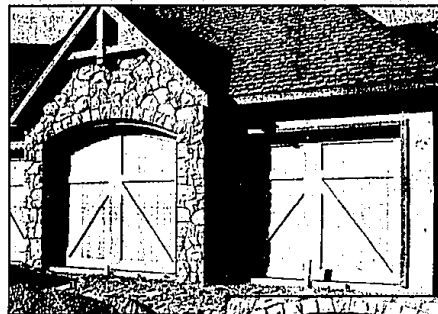
Carriage house: The carriage house style is popular today for garage doors.

Face value: This raised panel design, with ivy decorative window, shows how garage doors can take on any style. Tarnow Doors of Farmington Hills, which offers garage doors and garage door openers, is in the Home Improvement Show™ in Novi. The show starts today.