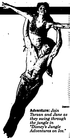
Adventure: Join Tarzan and Jane as they swing through the jungle in "Disney's Jungle Adventures on Ice."