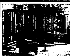
British Gentry Entertainment Center Price includes: Entertainment Center, left and right display cabinets and two corner units.

Remtech Business Solutions is planning to open a training center to upgrade the skills of recent graduates and working IT professionals who find it difficult to keep up with changing technology.