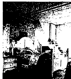
Summer Cottage Bedroom Price includes: Queen size bed and night stand.