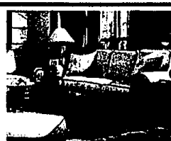
The Batali Sofa

This is an event you don't want to miss!