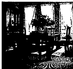
American Expressions Dining Room Price includes: Dining Table, Three side chairs and one arm chair, and China Cabinet.